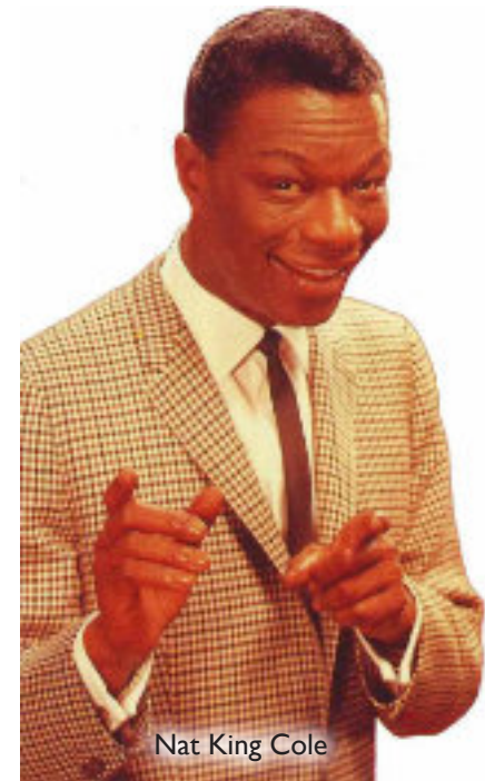
Nat King Cole